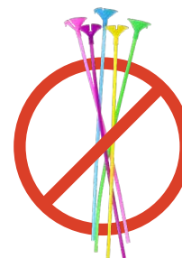
Plastic balloon sticks