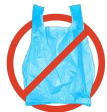
oxo degradable plastic