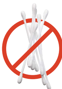
Plastic cotton bud sticks